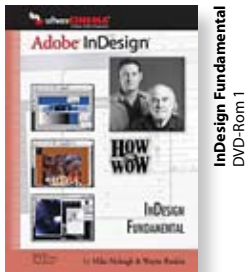
InDesign Fundamental DVD-Rom 1