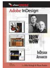
InDesign Advanced DVD-Rom 2

Here we place an image within our page and have our text run around it. There are some very important tips in this lesson to make text wrapping work for you.